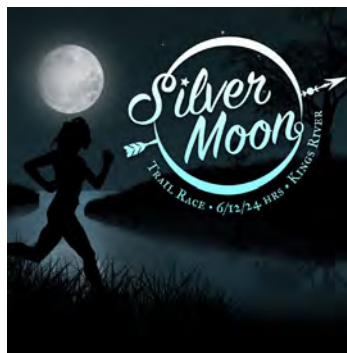
Silver Moon Race 6, 12, 24-Hour, 100-Mile SilverMoonRace.com