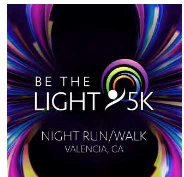
Be The Light 5K 10K/5K Night Run/Walk BeTheLight5k.com