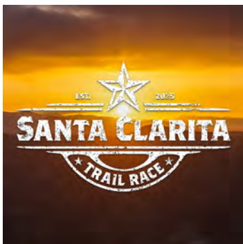
Santa Clarita Trail Race 28K/Half Marathon/10K/5K SantaClaritaTrailRace.com